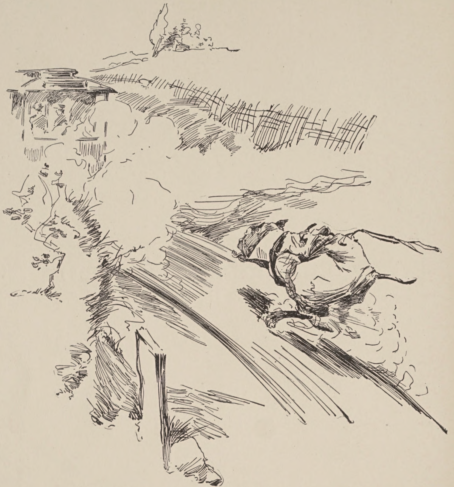
UGLY DOG TRIES TO OVERTAKE HIS MASTER.